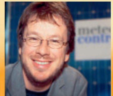
Jörg Kachelmann TV meteorologist

Precise weather data are not only a prerequisite for your load forecasts, they are also necessary for the supply of local weather information and the delivery of expert opinions. Furthermore, you need precise weather data to judge the power consumption of facilities and the gas consumption of tomorrow. Reliable weather forecasts therefore constitute the basis of economic energy management. Utility companies and network operators, energy manager of large facilities and engineers specialized in Facility Management, as well as insurance companies and experts, they all depend on precise weather forecasts and detailed historical weather records.